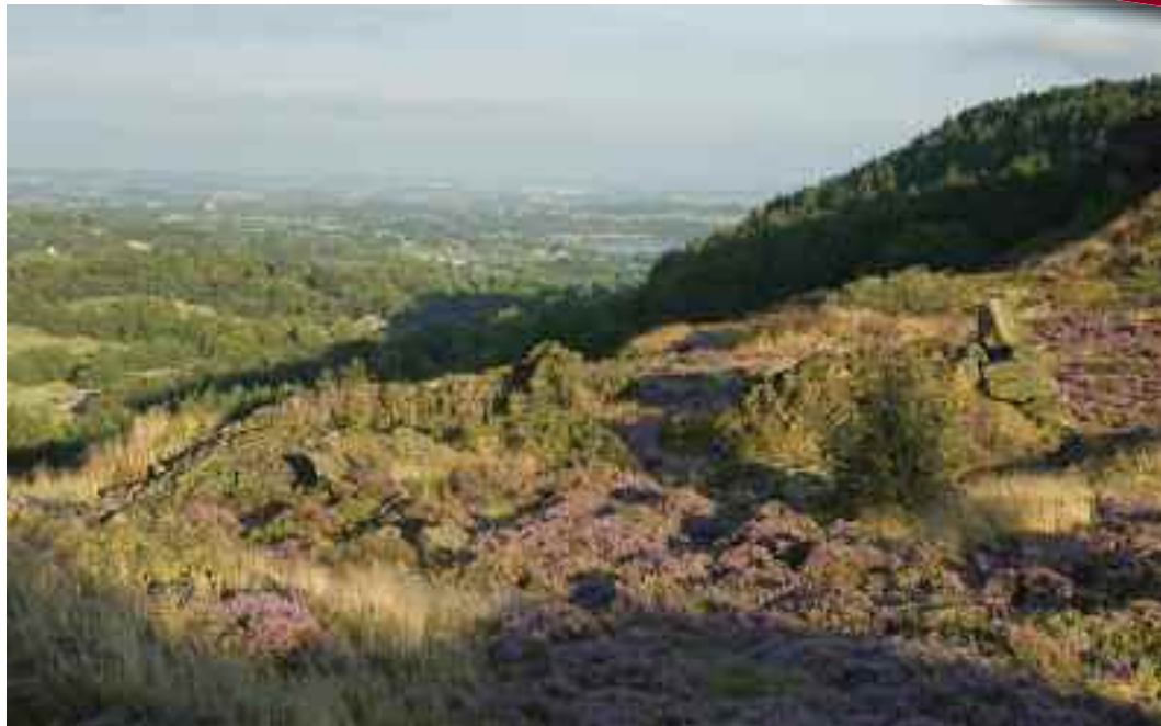
Picturesque NE Derbyshire - the view at Ashover

"It also highlights what a great place North East Derbyshire is to live, with one of the lowest crime rates in the country, access to great leisure facilities and some of the best countryside in Britain!"